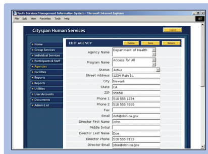
Monitor Program Staff and Partner Agencies